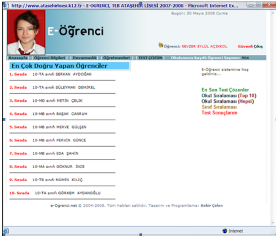
Figure 1a. Screen Capture of Web Based Application: Homepage

By developing this application, a “Top 5” students list was placed on the home page of the school (see Figure 2-a). The list consisted of the names and photos of students who gave the most correct answers, as well as some additional information including when they solved the questions, how much time he used, and his scores on the website. There was also a “Bottom 5” list to create a negative motivation for students and make them solve more questions. Also for motivation purposes, the list of the students that last solved the tests was also added to the home page. Therefore, the students could look at the home page to the “New Solvers” part to learn information such as “the names of the students who had recently used the application and solved the questions, how long ago they solved the questions, how many true answers they had given” to follow the competitors in this competitive system (see Figure 2-b).